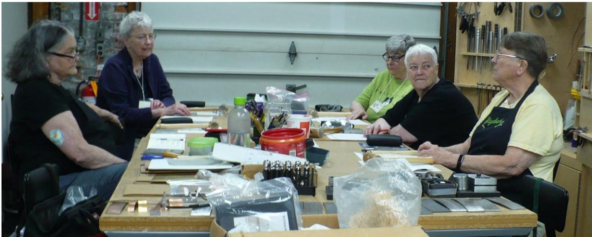
Metalsmithing: Objects made were pendants of silver, and copper bracelets