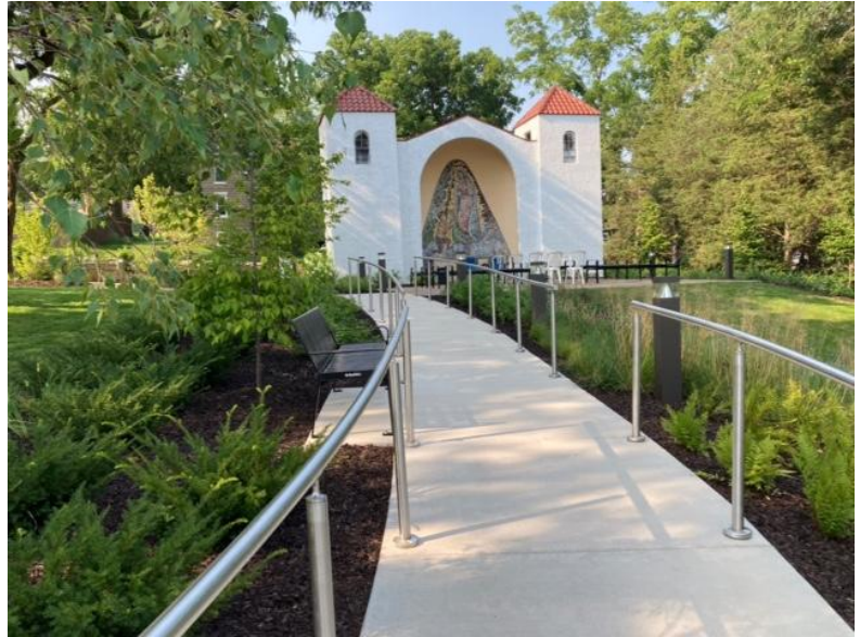
Redeveloped Shrine of Our Lady of Guadalupe in July, 2025