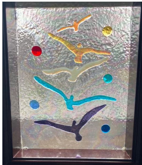
Doves in Flight