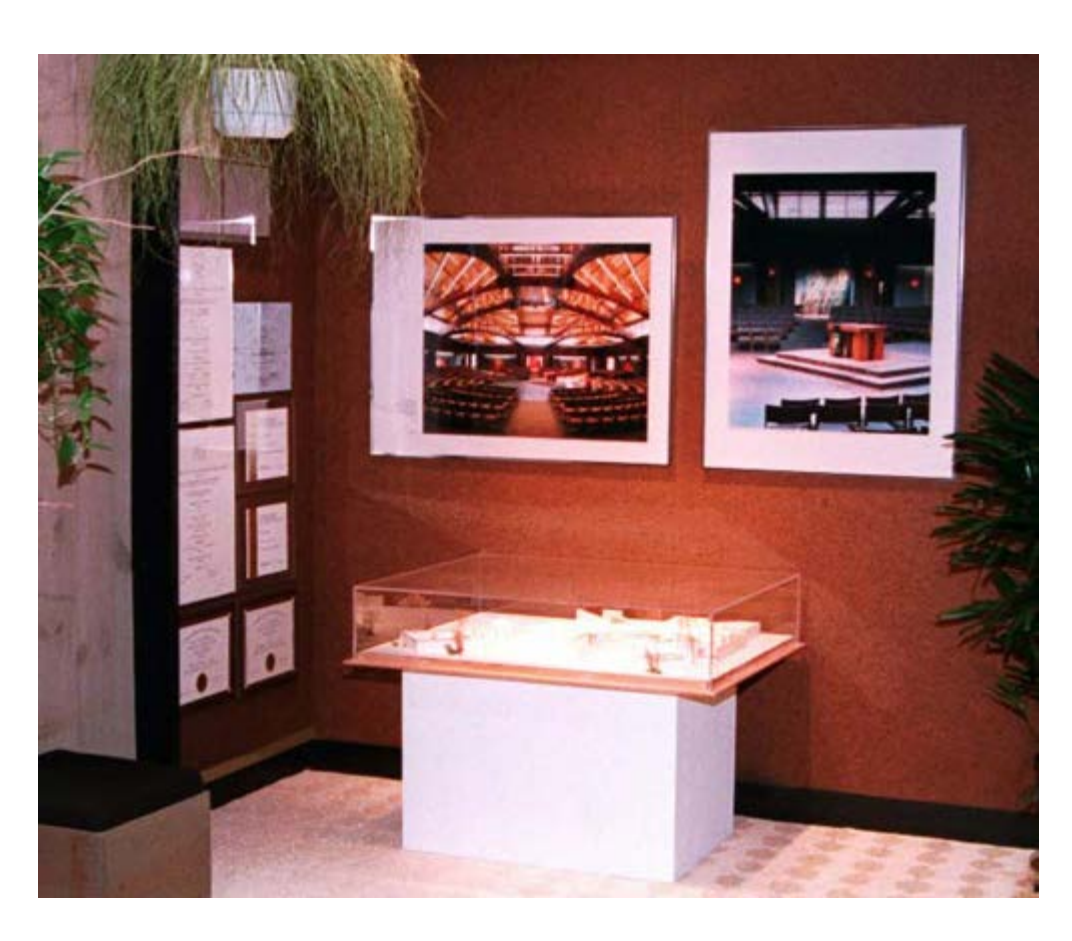
Display of INAI Studio sacred space interior design photos and awards in the lobby of Weber Center Retreat and Conference Center, Adrian, Michigan.

format files? Click on the link to download the latest Adobe Reader. It is safe and secure and free. Really.