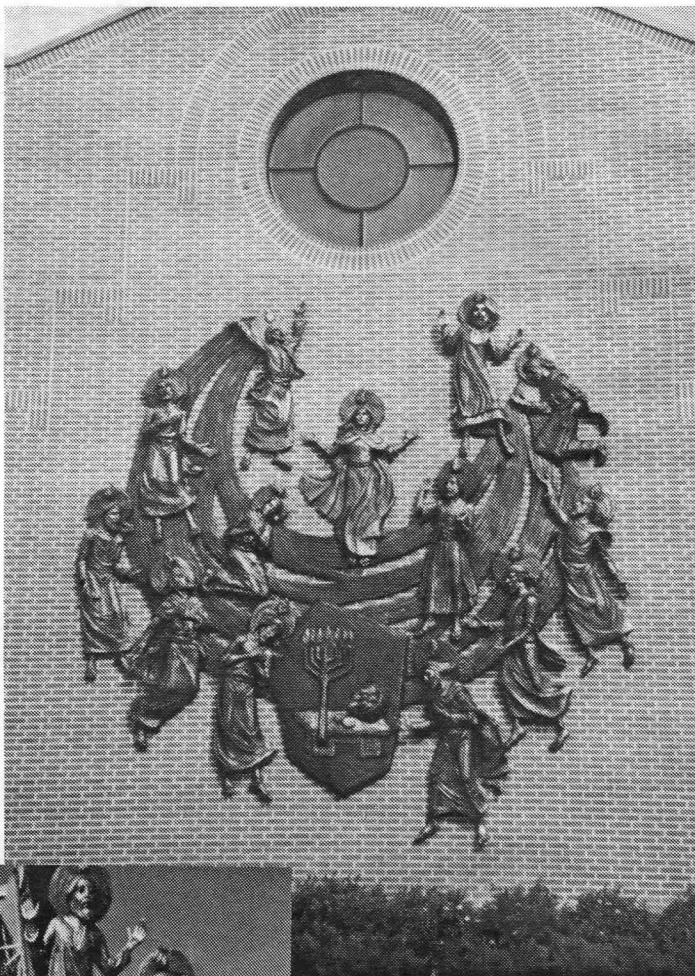
The bronze work of art still stands today at Holy Spirit Church (top photo).

After all, their light is our light – the light of the love of Jesus Christ.