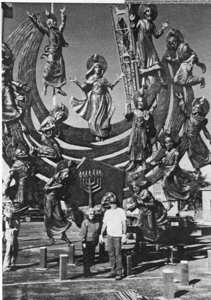
Installing "Pentecost," Holy Spirit Church, San Antonio, Texas, Jan 1995 22 ft. bronze (bottom photo).