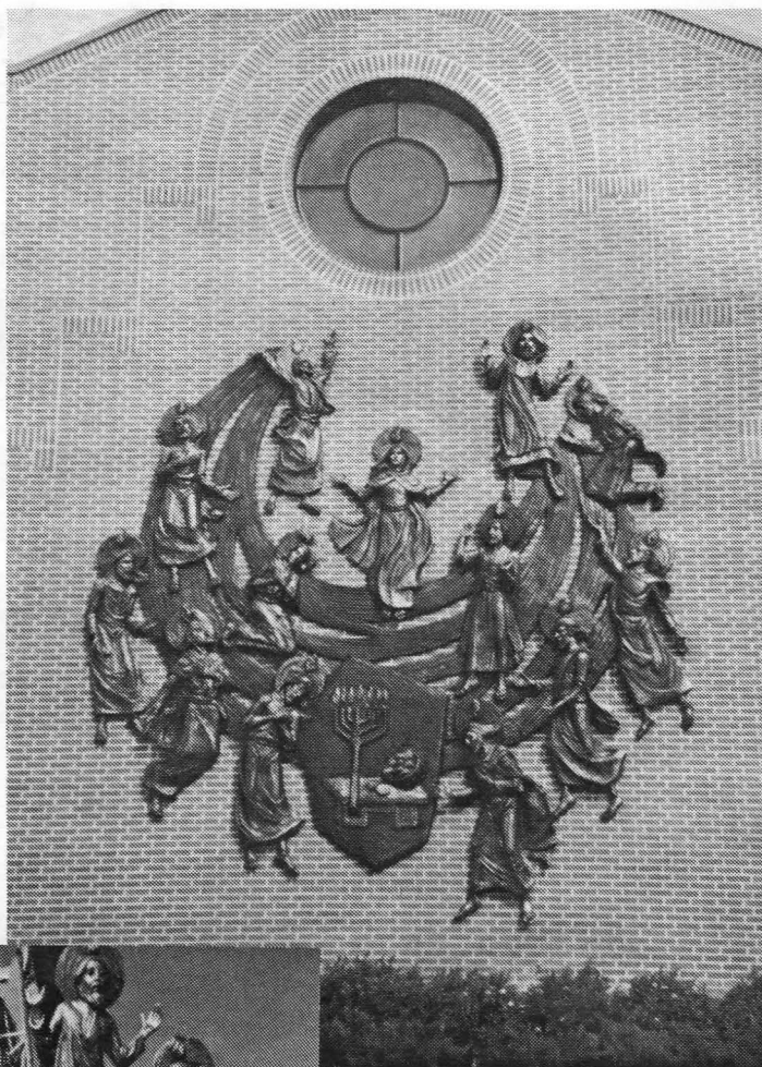
The bronze work of art still stands today at Holy Spirit Church (top photo).

After all, their light is our light – the light of the love of Jesus Christ.