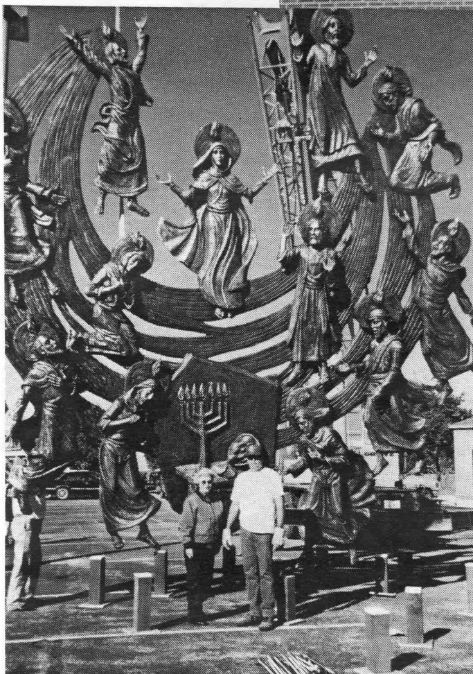
Installing "Pentecost," Holy Spirit Church, San Antonio, Texas, Jan 1995 22 ft. bronze (bottom photo).