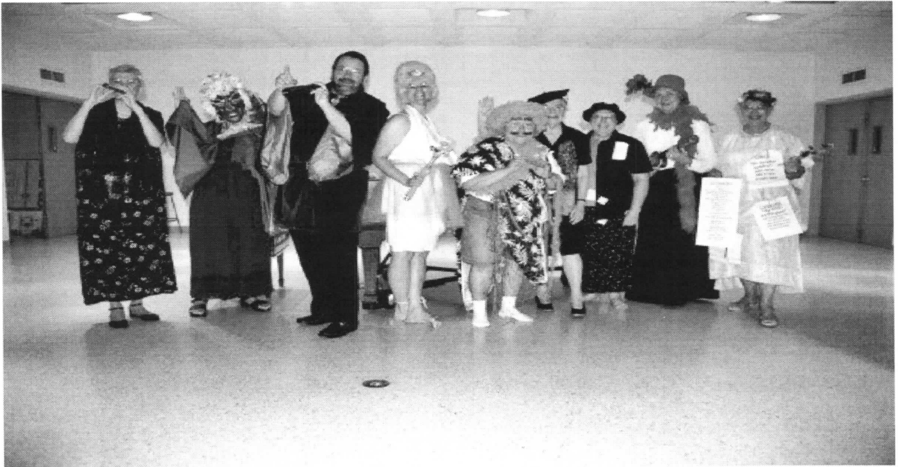
DIA Board impersonates the Nine Muses