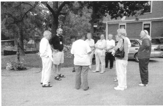
The Racine Dominican Eco-Justice Center