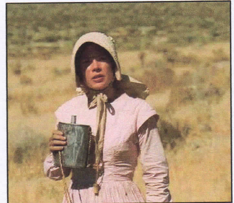
Michelle Williams in a scene from Meek's Cutoff

Contemplative films use the big screen to immerse us into an experience. This can be with wide shots that have several things going on at once, left and right, top and bottom, foreground and background. Or it can be done with close-ups that give us communion with characters such as the terrific actress Michelle Williams, the central character of Meek's Cutoff . The creators of this film use the big screen to immerse us in the journey of Oregon pioneers, but unlike the typical (widescreen) western, it cuts off the periphery, just like those pioneer women's bonnets, inciting our hearts to wonder about the mystery of what else is out there.